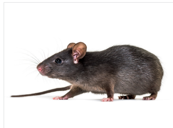
Scientific name: Rattus rattus Common name: House rat