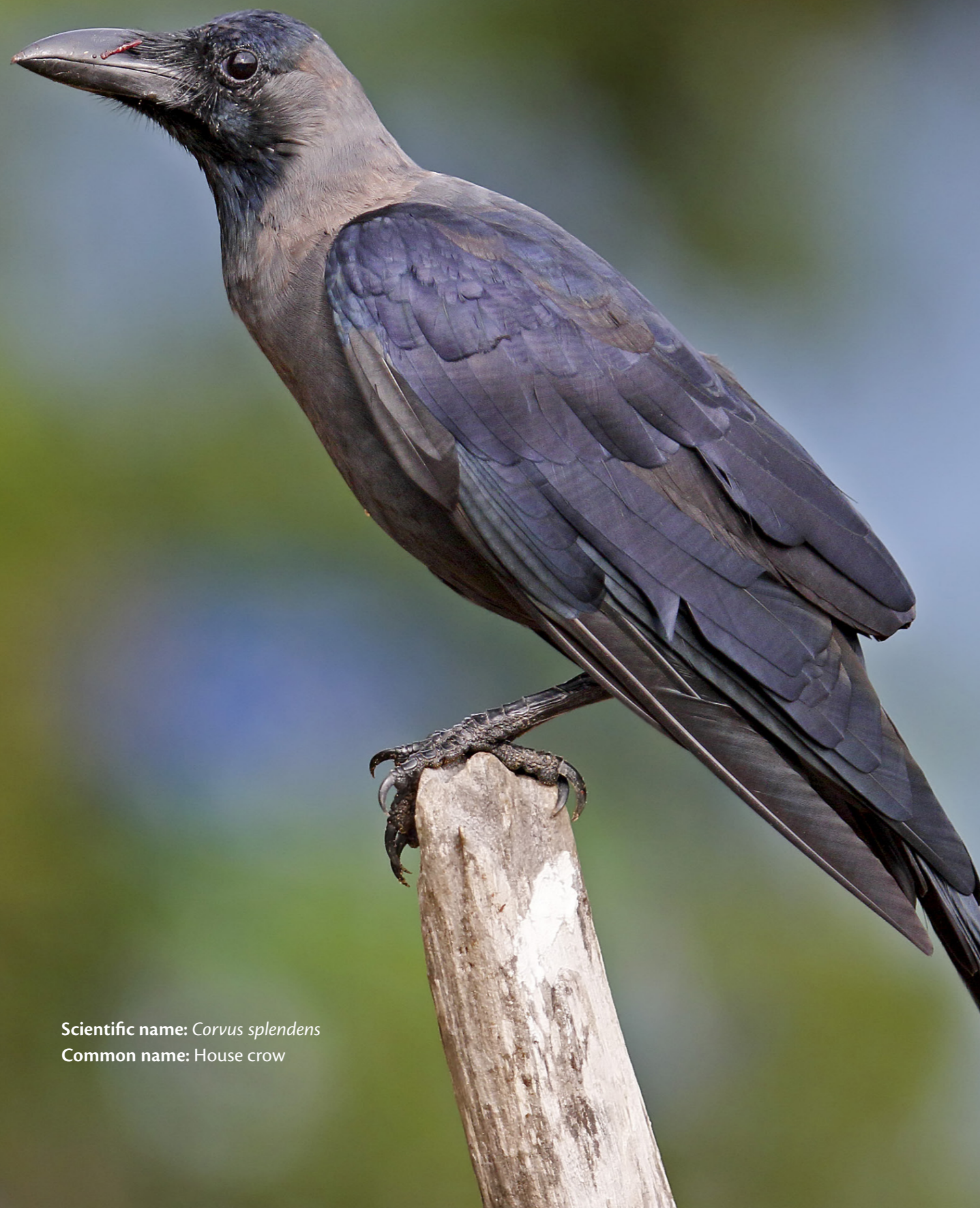
Scientific name: Corvus splendens Common name: House crow