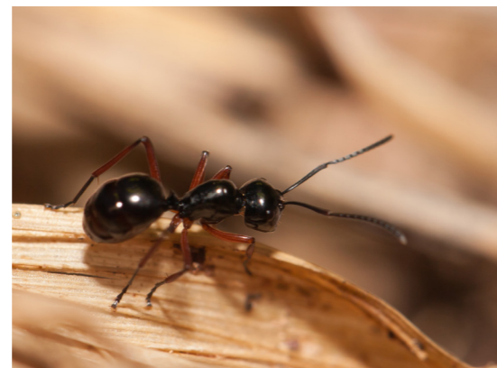
Scientific name: Iridomyrmex anceps Common name: Flat-backed tyrant ant