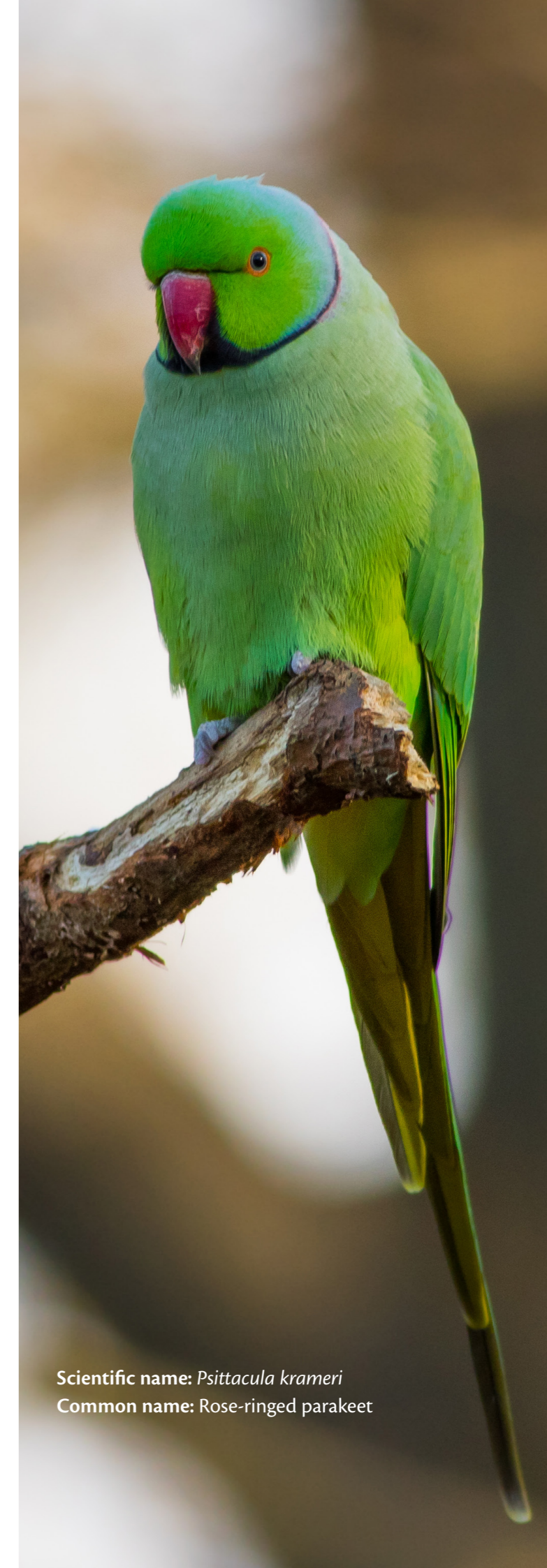
Scientific name: Psittacula krameri Common name: Rose-ringed parakeet

An annual review of the implementation plan and priority actions will be undertaken to address emerging needs and issues, and to measure progress toward achieving the plan’s outcomes. As information and management guidance on invasive species is constantly evolving, recommended management strategies and priority actions may also change over time—particularly as new information and research becomes available, or new high risk invasive species emerge.