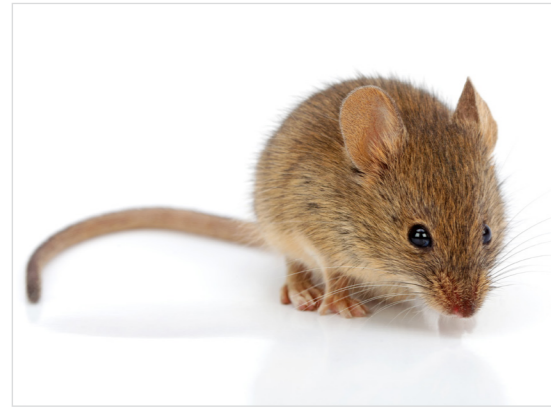
Scientific name: Mus musculus Common name: House mouse