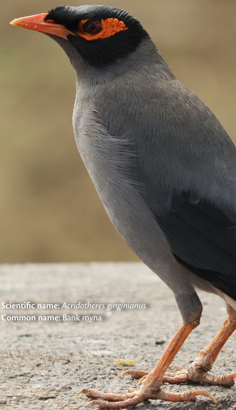
Scientific name: Acridotheres ginginianus Common name: Bank myna