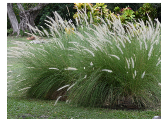
Scientific name: Pennisetum setaceum Common name: Fountain grass