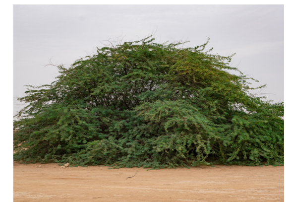
Scientific name: Prosopis juliflora Common name: Mesquite