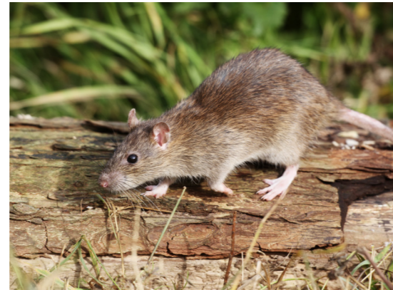
Scientific name: Rattus norvegicus Common name: Brown rat