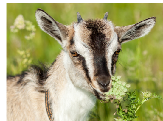
Scientific name: Capra hircus Common name: Goat