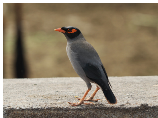
Scientific name: Acridotheres ginginianus Common name: Bank myna

In collaboration with the International Union for Conservation of Nature (IUCN), and the IUCN Species Survival Commission (SSC) Invasive Species Specialist Group (ISSG), a national workshop has been conducted to identify the IAS in the UAE. A list of IAS had been identified by workshop participants consists of 24 species (appendix 1) that was further reduced to have a priority list of IAS that provides information on detection, eradication and control measures of the 20 priority species.