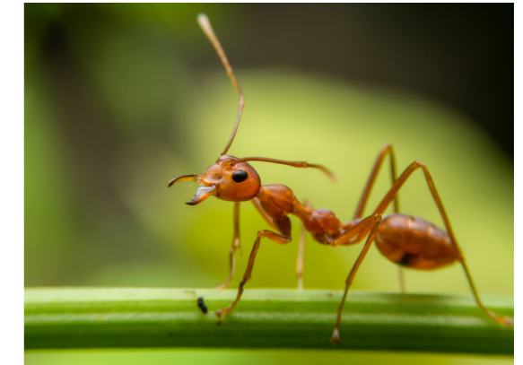
Scientific name: Solenopsis geminata Common name: Fire ant