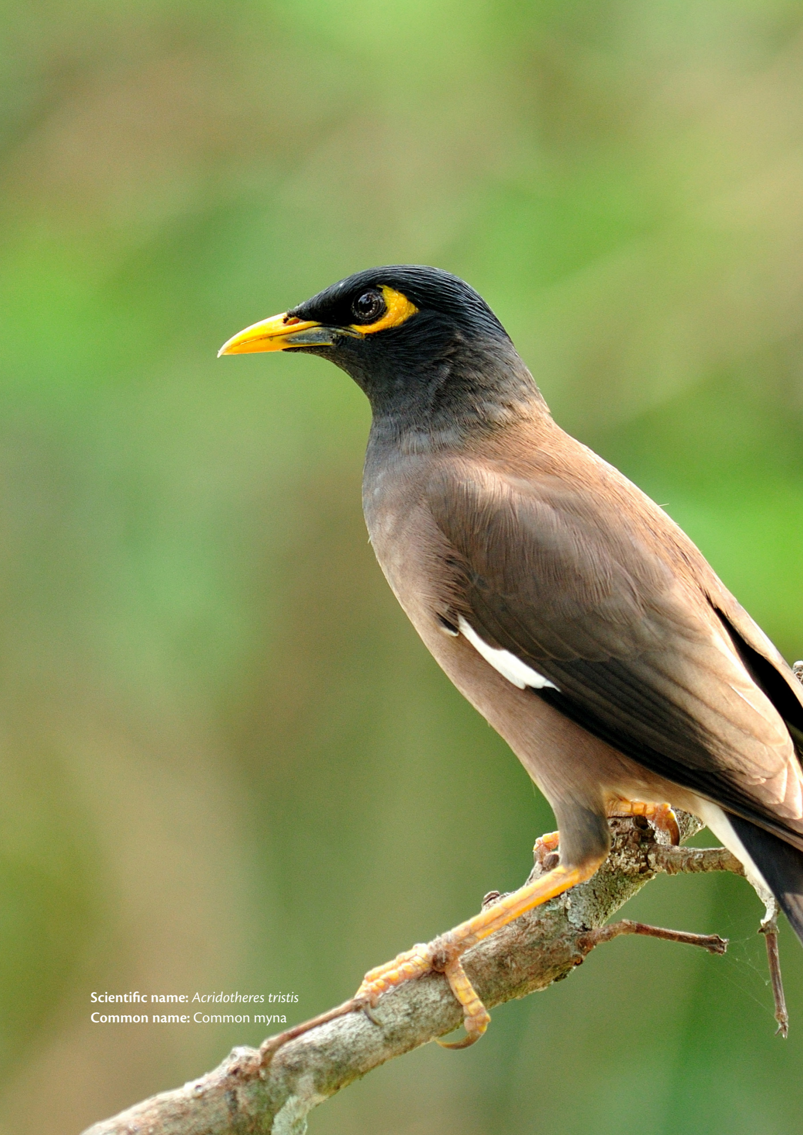
Scientific name: Acridotheres tristis Common name: Common myna