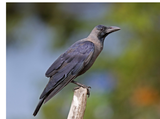
Scientific name: Corvus splendens Common name: House crow