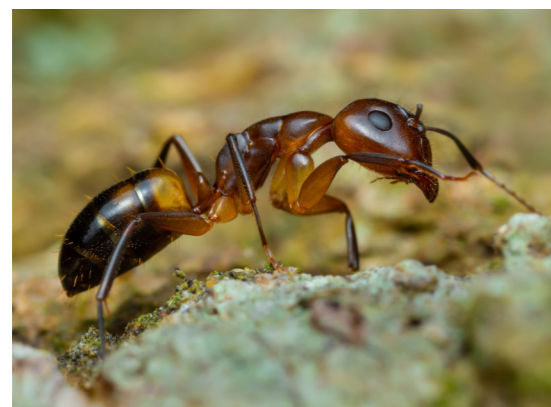
Scientific name: Linepithema humile Common name: Argentine ant