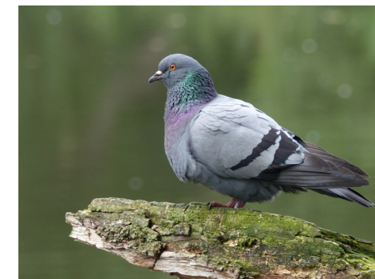
Scientific name: Columba livia Common name: Rock dove