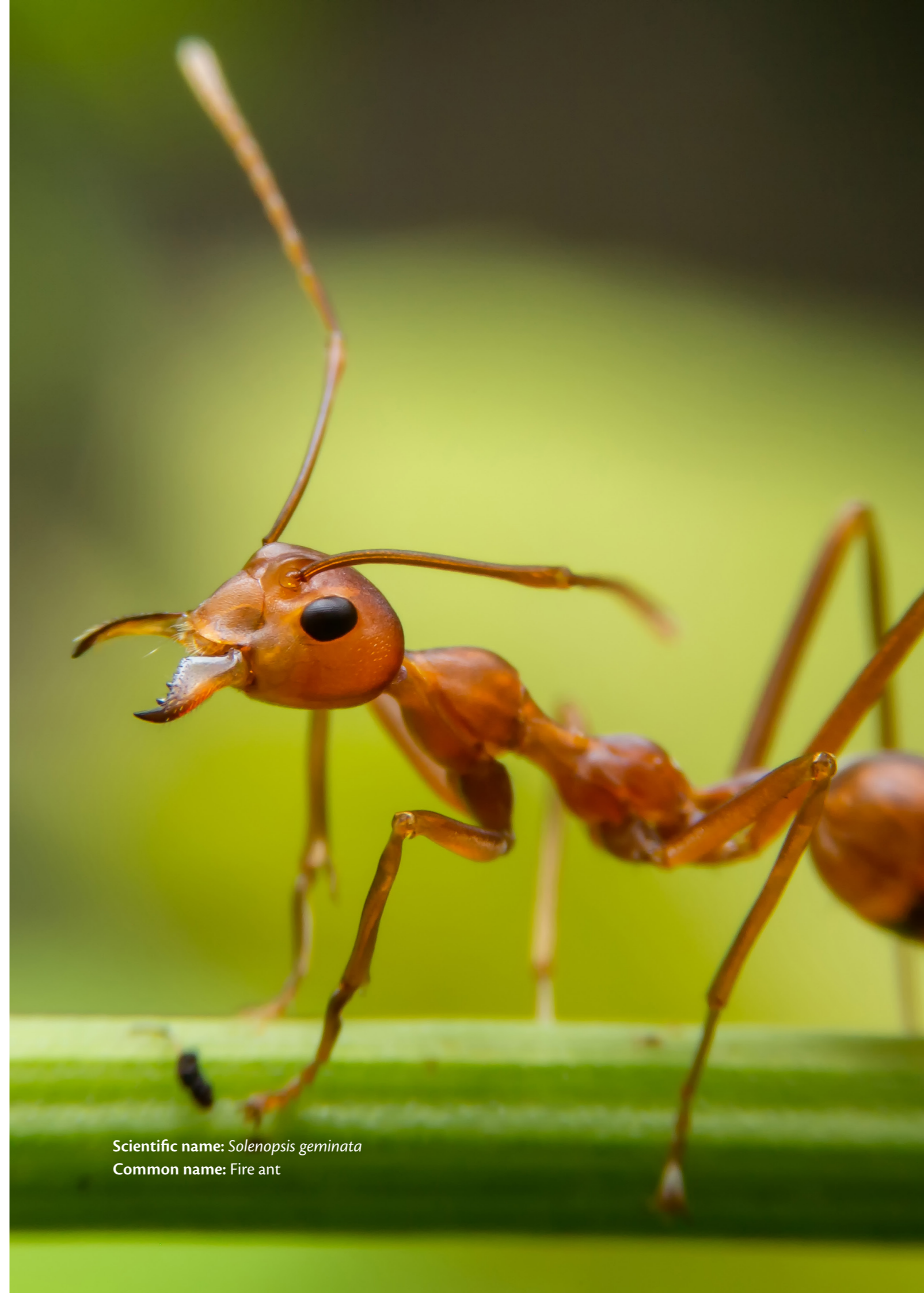
Scientific name: Solenopsis geminata Common name: Fire ant