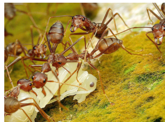
Scientific name: Monomorium destructor Common name: Singapore ant