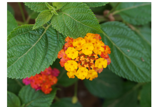
Scientific name: Lantana camara L. Common name: Wild-sage