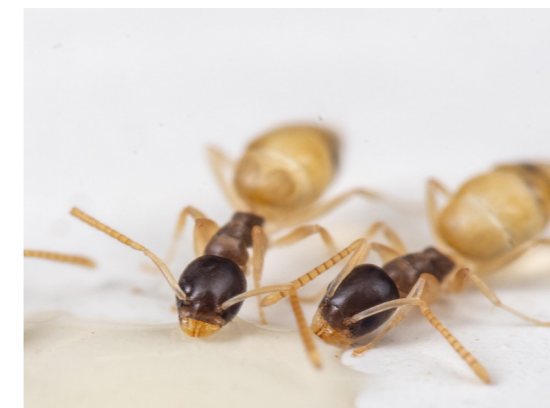
Scientific name: Tapinoma melanocephalum Common name: Ghost ant