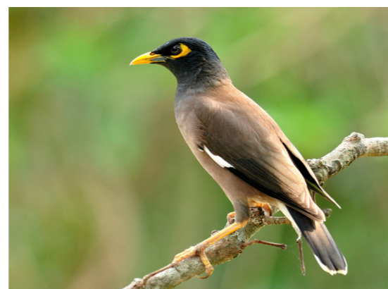
Scientific name: Acridotheres tristis Common name: Common myna