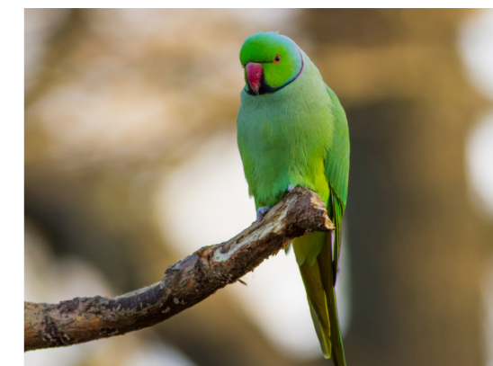
Scientific name: Psittacula krameri Common name: Rose-ringed parakeet