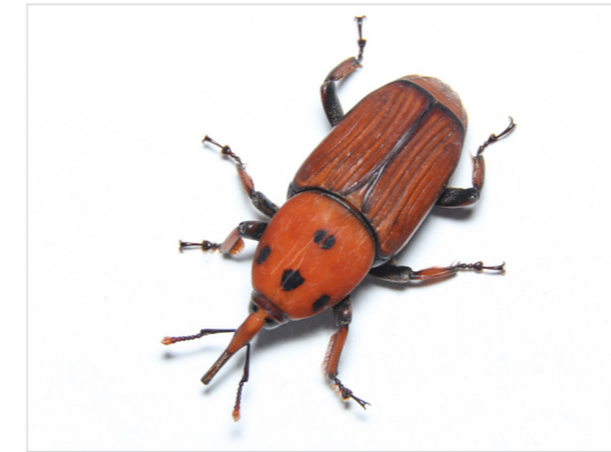
Scientific name: Rhynchophorus ferrugineus Common name: Red palm weevil