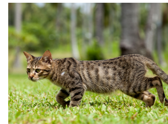
Scientific name: Felis catus Common name: Feral Cat