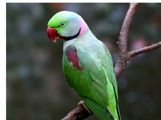
Scientific name: Psittacula eupatria Common name: Alexandrine parakeet